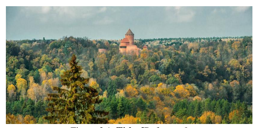
Figure 3.1. Title. [Reference]